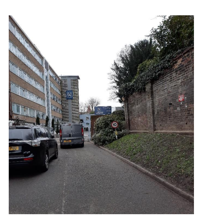
Northbridge House Senior School