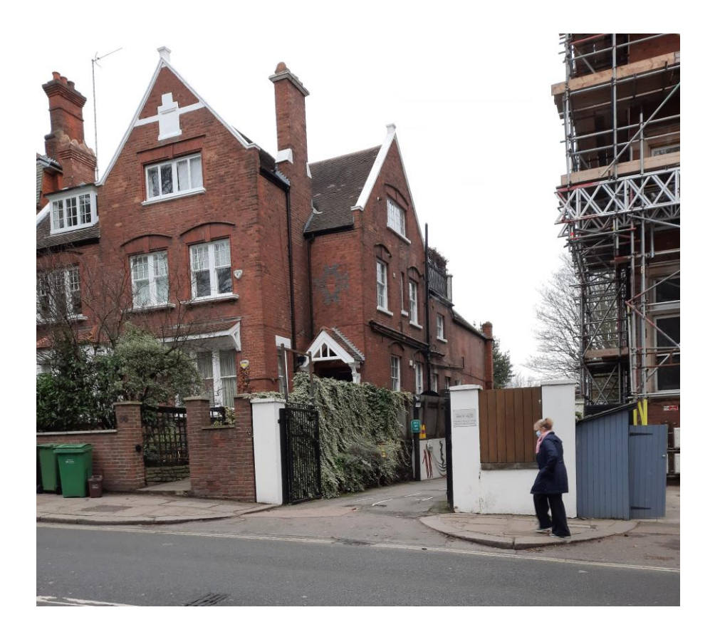
Fitzjohn's Primary (wooden sign appears to be missing)