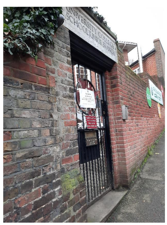
UCS Junior School